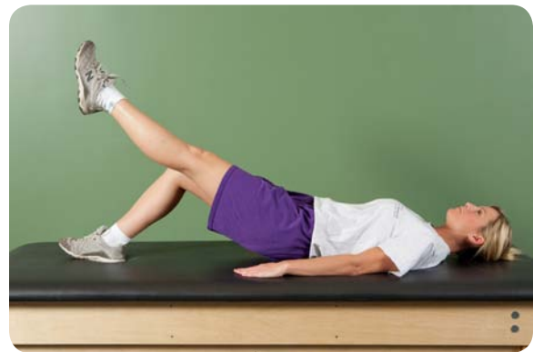
Double leg bridges to single leg bridges