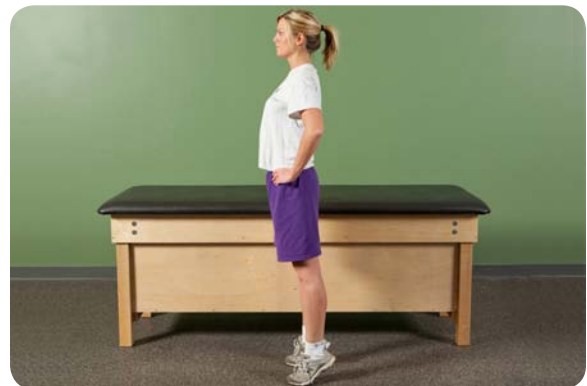
Standing heel lifts