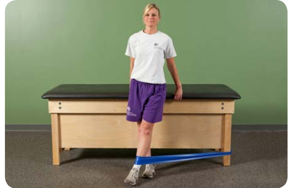
Standing theraband/pulley weight – Adduction