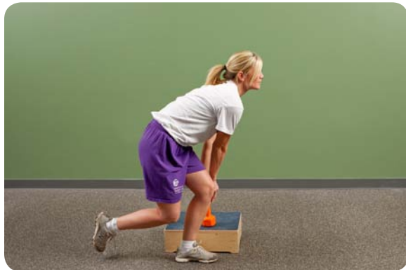
Single leg pick-ups, add soft surface