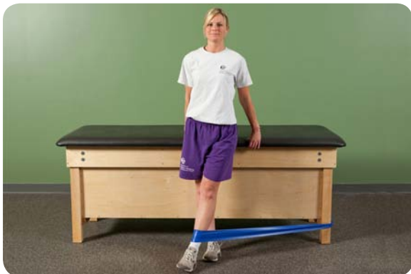
Theraband resistance on affected side – Adduction (start very low resistance)