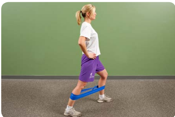
Theraband walking patterns – forward, sidestepping, carioca, monster steps, backward, ½ circles forward/backward – 25yds. Start band at knee height and progress to ankle height