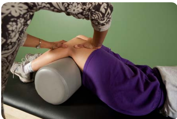
Stiffness dominant hip mobilization – grades III, IV