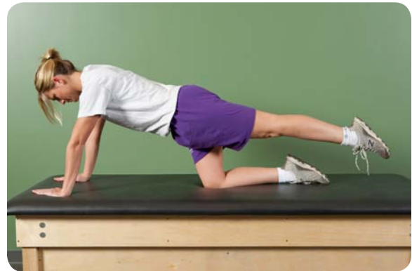
Quadruped 4 point support, progress 3 point support, progress 2 point