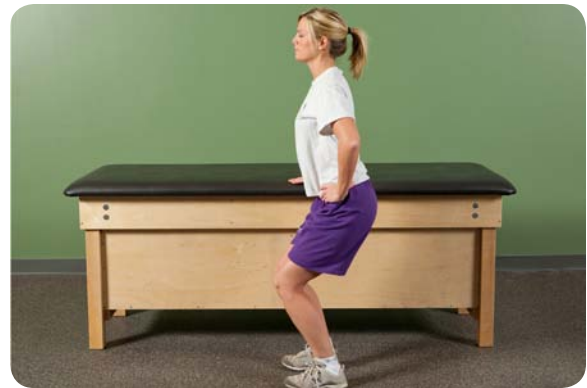
¼ Mini squats