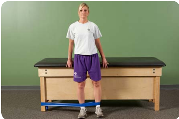
Theraband resistance on affected side – Abduction (start very low resistance)