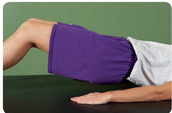
Double leg bridges