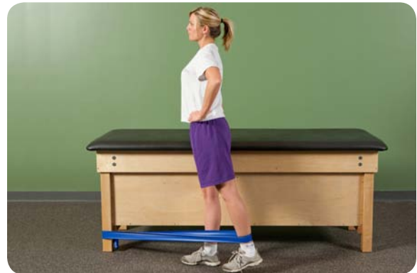
Theraband resistance on affected side – Extension (start very low resistance)