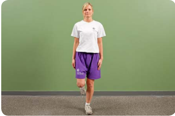
Single leg balance – firm to soft surface