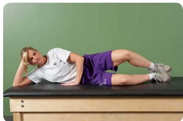
Clamshells (pain-free range)