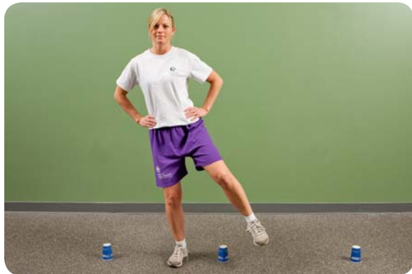
Lateral walking over cups and hurdles (pause on affected limb), add ball toss while walking