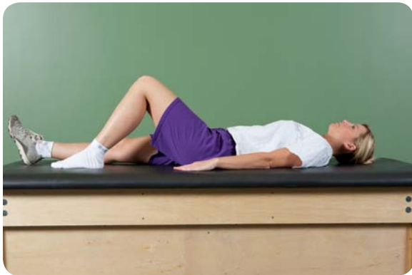
Heel slides, active-assisted range of motion