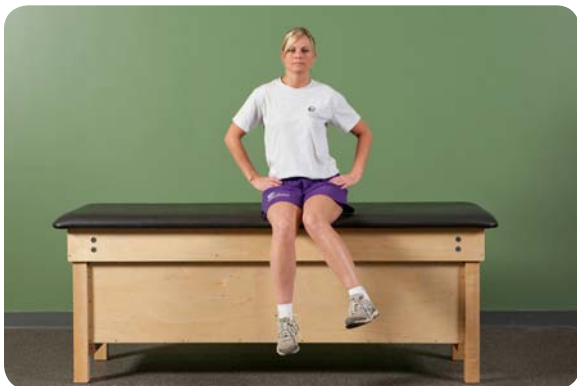
Weight shifts – anterior/posterior