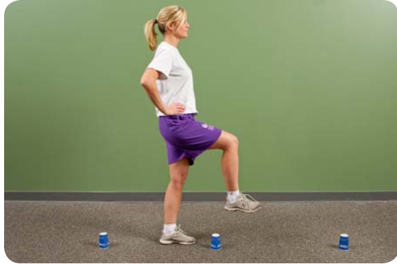
Forward walking over cups and hurdles (pause on affected limb), add ball toss while walking