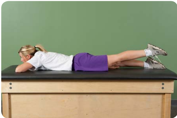
Leg raise – Extension