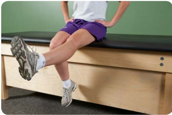
Seated knee extensions