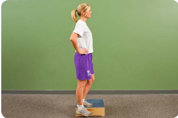
Step-ups with eccentric lowering