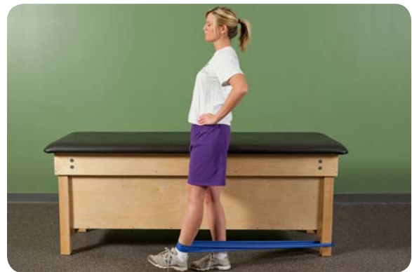
Standing theraband/pulley weight – Flexion