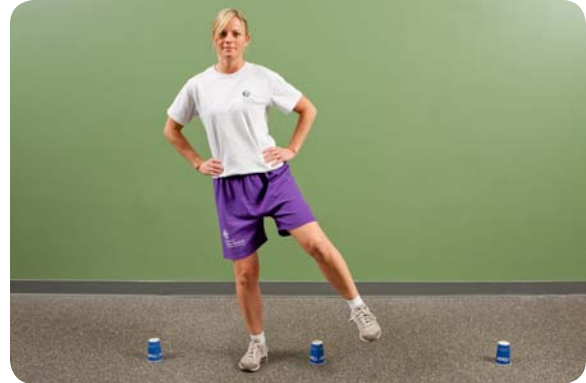
Side steps over cups/hurdles (with ball toss and external sports cord resistance), increase speed