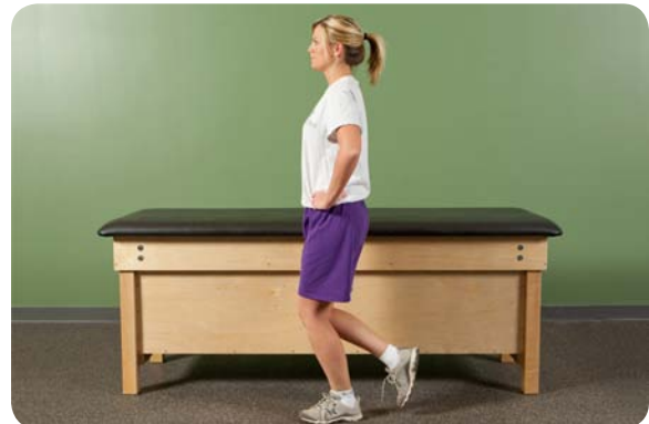
Single leg body weight squats, increase external resistance, stand on soft surface