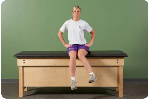
Seated weight shifts, lateral