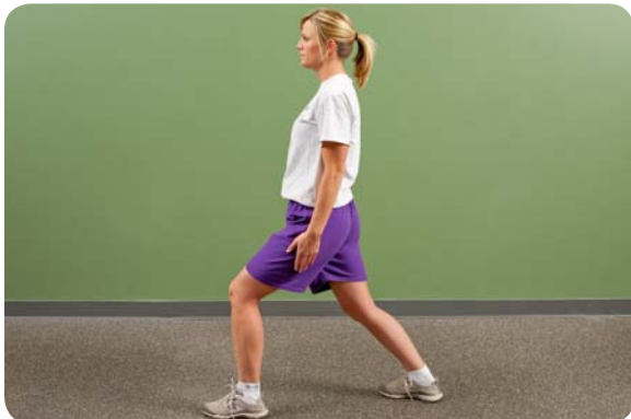
Lunges progress from single plane to tri-planar, add medicine balls for resistance and rotation