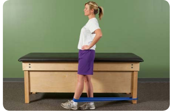
Theraband resistance on affected side – Flexion (start very low resistance)