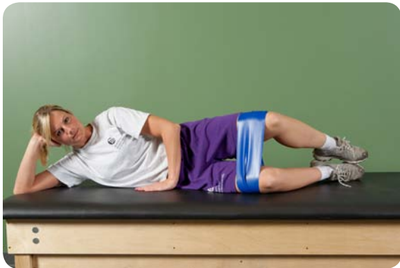
Clamshells with theraband