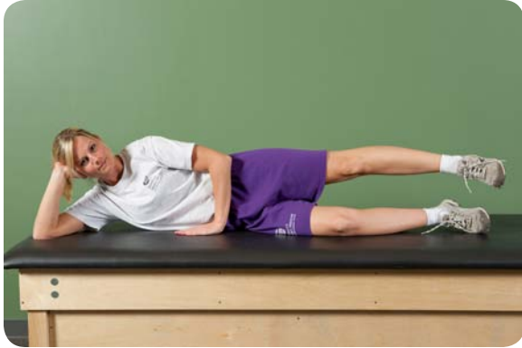
Leg raise – Abduction