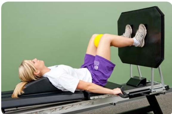
Leg press (gradually increasing weight)