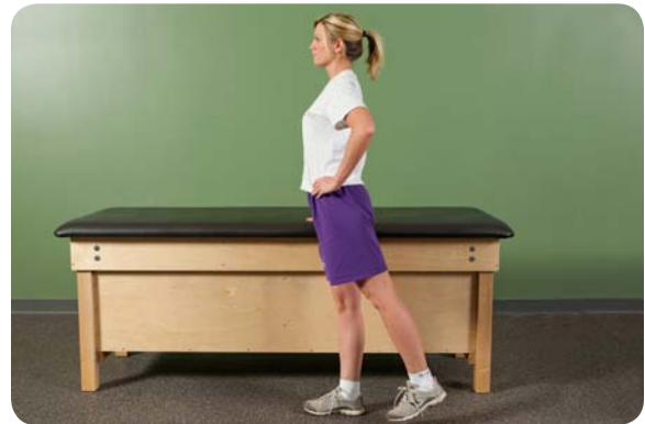
Standing extension without resistance