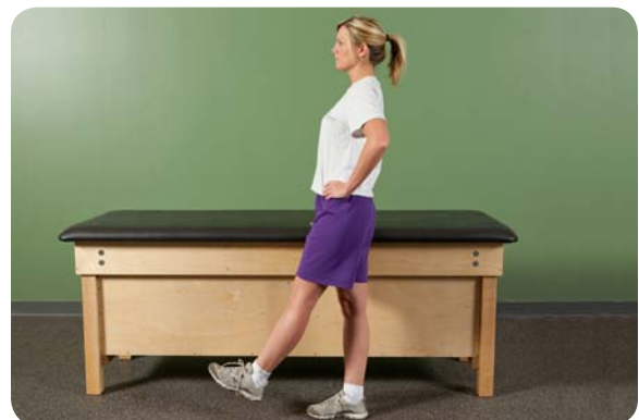
Standing flexion without resistance