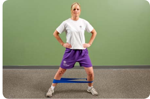
Sidestepping with resistance (pause on affected limb), sports cord walking forward and backward (pause on affected limb)