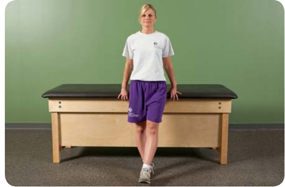
Standing adduction without resistance