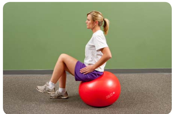
Seated physioball progression – hip flexion