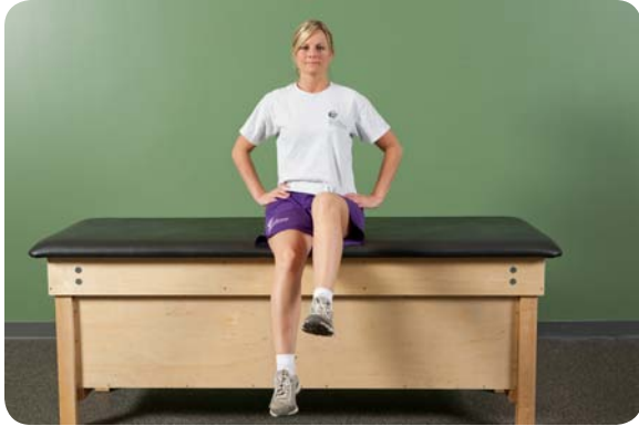
Hip flexion, IR/ER in pain-free range